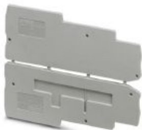
End cover, length: 90.8 mm, width: 2.2 mm, height: 33.8 mm, color: gray

Please be informed that the data shown in this PDF Document is generated from our Online Catalog. Please find the complete data in the user's documentation. Our General Terms of Use for Downloads are valid ( http://phoenixcontact.com/download )