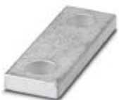
Connection rail, number of positions: 2, color: silver