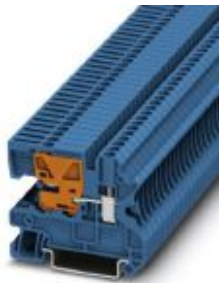
N disconnect terminal block, for neutral conductor disconnection, Screw connection, cross section: 0.14 mm 2 - 4 mm 2 , AWG: 26 - 12, width: 5.2 mm, color: blue, mounting type: NS 35/7,5, NS 35/15

Please be informed that the data shown in this PDF Document is generated from our Online Catalog. Please find the complete data in the user's documentation. Our General Terms of Use for Downloads are valid ( http://phoenixcontact.com/download )