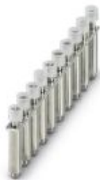
Screw bridge, with insulating collar, pitch: 8.2 mm, number of positions: 10, color: silver

Please be informed that the data shown in this PDF Document is generated from our Online Catalog. Please find the complete data in the user's documentation. Our General Terms of Use for Downloads are valid ( http://phoenixcontact.com/download )