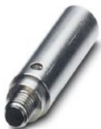
Female test connector, for 4 mm test plugs, for screwing into the bridge shaft, color: silver

Please be informed that the data shown in this PDF Document is generated from our Online Catalog. Please find the complete data in the user's documentation. Our General Terms of Use for Downloads are valid ( http://phoenixcontact.com/download )