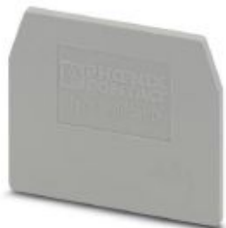
End cover, length: 45.5 mm, width: 2.2 mm, height: 36.5 mm, color: gray

Please be informed that the data shown in this PDF Document is generated from our Online Catalog. Please find the complete data in the user's documentation. Our General Terms of Use for Downloads are valid ( http://phoenixcontact.com/download )