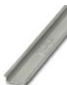
DIN rail, unperforated, Standard profile, width: 35 mm, height: 7.5 mm, acc. to EN 60715, material: Steel, galvanized, passivated with a thick layer, length: 2000 mm, color: silver

DIN rail, unperforated - NS 35/ 7,5 UNPERF 2000MM - 0801681