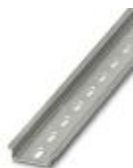
DIN rail perforated, Standard profile, width: 35 mm, height: 7.5 mm, acc. to EN 60715, material: Steel, galvanized, passivated with a thick layer, length: 2000 mm, color: silver

DIN rail perforated - NS 35/ 7,5 PERF 2000MM - 0801733