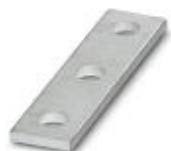
Connection rail, number of positions: 3, color: silver