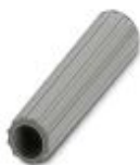
Insulating sleeve, color: gray