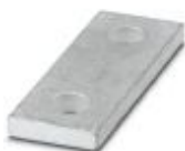
Connection rail, number of positions: 2, color: silver