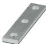
Connection rail, number of positions: 3, color: silver