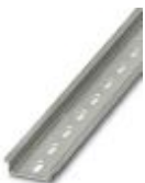
DIN rail perforated, Standard profile, width: 35 mm, height: 7.5 mm, acc. to EN 60715, material: Steel, galvanized, passivated with a thick layer, length: 2000 mm, color: silver

DIN rail perforated - NS 35/ 7,5 PERF 2000MM - 0801733