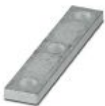
Connection rail, number of positions: 3, color: silver