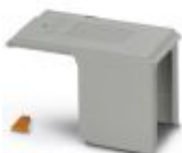
Covering hood, length: 164 mm, width: 54.8 mm, height: 33 mm, color: gray