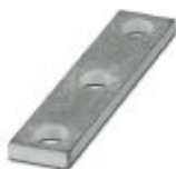
Connection rail, number of positions: 3, color: silver