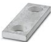
Connection rail, number of positions: 2, color: silver