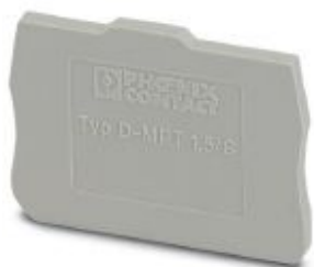
End cover, length: 33.6 mm, width: 2.2 mm, height: 22.3 mm, color: gray

Please be informed that the data shown in this PDF Document is generated from our Online Catalog. Please find the complete data in the user's documentation. Our General Terms of Use for Downloads are valid ( http://phoenixcontact.com/download )