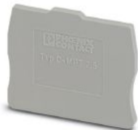
End cover, length: 36 mm, width: 2.2 mm, height: 27.1 mm, color: gray

Please be informed that the data shown in this PDF Document is generated from our Online Catalog. Please find the complete data in the user's documentation. Our General Terms of Use for Downloads are valid ( http://phoenixcontact.com/download )