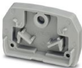
End cover, length: 32 mm, width: 4 mm, height: 20 mm, color: gray

Please be informed that the data shown in this PDF Document is generated from our Online Catalog. Please find the complete data in the user's documentation. Our General Terms of Use for Downloads are valid ( http://phoenixcontact.com/download )