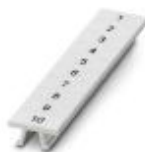
Zack marker strip, white, Printed vertically: consecutive numbers 1 ... 10, 11 ... 20, etc. up to 491 ... 500, mounting type: snap into tall marker groove, for terminal block width: 5.2 mm, lettering field size: 5.15 x 10.5 mm

Zack marker strip - ZB 5,QR:FORTL.ZAHLEN - 1050020