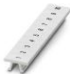
Zack marker strip, Strip, white, labeled, printed horizontally: consecutive numbers 1 ... 10, 11 ... 20, etc. up to 491 ... 500, mounting type: snap into tall marker groove, for terminal block width: 5.2 mm, lettering field size: 5.15 x 10.5 mm, Number of individual labels: 10

Zack marker strip - ZB 5,LGS:FORTL.ZAHLEN - 1050017