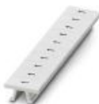
Zack marker strip, Strip, white, labeled, can be labeled with: CMS-P1-PLOTTER, printed horizontally: Identical numbers 1 or 2, etc. up to 100, mounting type: snap into tall marker groove, for terminal block width: 5.2 mm, lettering field size: 5.15 x 10.5 mm, Number of individual labels: 10

Zack marker strip - ZB 5,LGS:GLEICHE ZAHLEN - 1050033