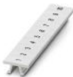
Zack marker strip, Strip, white, labeled, printed horizontally: consecutive numbers 1 ... 10, 11 ... 20, etc. up to 491 ... 500, mounting type: snap into tall marker groove, for terminal block width: 5.2 mm, lettering field size: 5.15 x 10.5 mm, Number of individual labels: 10

Zack marker strip - ZB 5,LGS:FORTL.ZAHLEN - 1050017