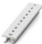
Zack marker strip, white, Printed vertically: consecutive numbers 1 ... 10, 11 ... 20, etc. up to 491 ... 500, mounting type: snap into tall marker groove, for terminal block width: 5.2 mm, lettering field size: 5.15 x 10.5 mm

Zack marker strip - ZB 5,QR:FORTL.ZAHLEN - 1050020