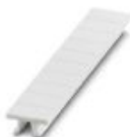
Zack marker strip, can be ordered: Strip, white, labeled according to customer specifications, mounting type: snap into tall marker groove, for terminal block width: 5.2 mm, lettering field size: 5.15 x 10.5 mm, Number of individual labels: 10

Zack marker strip - ZB 5,LGS:FORTL.ZAHLEN - 1050017