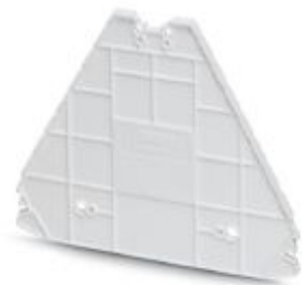
End cover, length: 100 mm, width: 3.8 mm, height: 80.8 mm, color: white

Please be informed that the data shown in this PDF Document is generated from our Online Catalog. Please find the complete data in the user's documentation. Our General Terms of Use for Downloads are valid ( http://phoenixcontact.com/download )