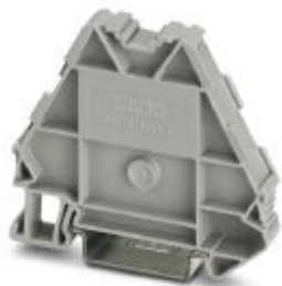
Spacer plate, length: 63.6 mm, width: 8.3 mm, height: 54 mm, color: gray

Please be informed that the data shown in this PDF Document is generated from our Online Catalog. Please find the complete data in the user's documentation. Our General Terms of Use for Downloads are valid ( http://phoenixcontact.com/download )