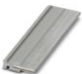
Plug-in bridge, length: 50 mm, color: gray

Plug-in bridge - FBST 50-PLC GY - 1081053