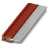
Plug-in bridge, length: 50 mm, color: red

Plug-in bridge - FBST 50-PLC RD - 1081050