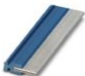
Plug-in bridge, length: 50 mm, color: blue

Plug-in bridge - FBST 50-PLC BU - 1081051