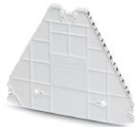
End cover, length: 100 mm, width: 2.2 mm, height: 80.8 mm, color: white

Please be informed that the data shown in this PDF Document is generated from our Online Catalog. Please find the complete data in the user's documentation. Our General Terms of Use for Downloads are valid ( http://phoenixcontact.com/download )