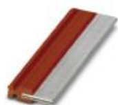
Plug-in bridge, length: 50 mm, color: red

Plug-in bridge - FBST 50-PLC RD - 1081050