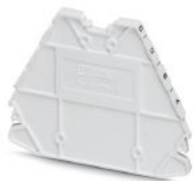
End cover, length: 63.6 mm, width: 2.2 mm, height: 48.9 mm, color: white

Please be informed that the data shown in this PDF Document is generated from our Online Catalog. Please find the complete data in the user's documentation. Our General Terms of Use for Downloads are valid ( http://phoenixcontact.com/download )