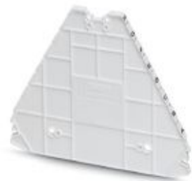
End cover, length: 100 mm, width: 2.2 mm, height: 80.8 mm, color: white

Please be informed that the data shown in this PDF Document is generated from our Online Catalog. Please find the complete data in the user's documentation. Our General Terms of Use for Downloads are valid ( http://phoenixcontact.com/download )