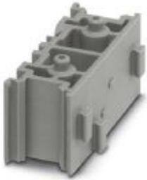
Marker adapter, for accommodating the marking, length: 30 mm, width: 12.2 mm, height: 13 mm, color: gray

Please be informed that the data shown in this PDF Document is generated from our Online Catalog. Please find the complete data in the user's documentation. Our General Terms of Use for Downloads are valid ( http://phoenixcontact.com/download )