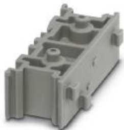
Marker adapter, for accommodating the marking, length: 30 mm, width: 8.5 mm, height: 13 mm, color: gray

Please be informed that the data shown in this PDF Document is generated from our Online Catalog. Please find the complete data in the user's documentation. Our General Terms of Use for Downloads are valid ( http://phoenixcontact.com/download )