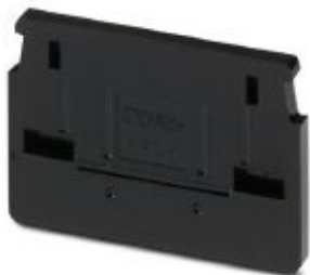
End cover, length: 46 mm, width: 3.5 mm, height: 30.7 mm, color: black

Please be informed that the data shown in this PDF Document is generated from our Online Catalog. Please find the complete data in the user's documentation. Our General Terms of Use for Downloads are valid ( http://phoenixcontact.com/download )