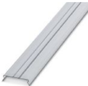
Cover profile, length: 46 mm, width: 1000 mm, height: 9.8 mm, color: transparent

Please be informed that the data shown in this PDF Document is generated from our Online Catalog. Please find the complete data in the user's documentation. Our General Terms of Use for Downloads are valid ( http://phoenixcontact.com/download )