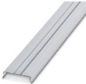
Cover profile, length: 50 mm, width: 1000 mm, height: 9.8 mm, color: transparent

Please be informed that the data shown in this PDF Document is generated from our Online Catalog. Please find the complete data in the user's documentation. Our General Terms of Use for Downloads are valid ( http://phoenixcontact.com/download )