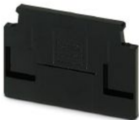
End cover, length: 59 mm, width: 3.5 mm, height: 37.7 mm, color: black

Please be informed that the data shown in this PDF Document is generated from our Online Catalog. Please find the complete data in the user's documentation. Our General Terms of Use for Downloads are valid ( http://phoenixcontact.com/download )