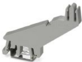
Cover profile holder, 10 mm wide, for mounting on NS 32 or NS 35/7.5, for fixing the holding profile APK-HP, labeling with Zack strip ZB 10

Please be informed that the data shown in this PDF Document is generated from our Online Catalog. Please find the complete data in the user's documentation. Our General Terms of Use for Downloads are valid ( http://phoenixcontact.com/download )