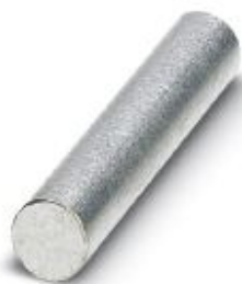
Feed-through metal in the form of a cartridge fuse insert 5 x 30 mm for use in UK 5-HESI fuse terminal blocks.

Please be informed that the data shown in this PDF Document is generated from our Online Catalog. Please find the complete data in the user's documentation. Our General Terms of Use for Downloads are valid ( http://phoenixcontact.com/download )