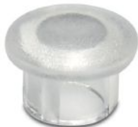
Light cap, length: 4 mm, diameter: 6 mm, color: transparent

Please be informed that the data shown in this PDF Document is generated from our Online Catalog. Please find the complete data in the user's documentation. Our General Terms of Use for Downloads are valid ( http://phoenixcontact.com/download )