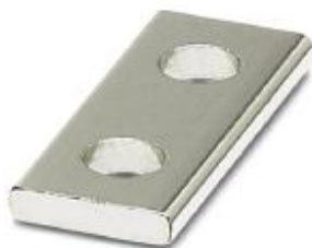
Connection rail, number of positions: 2, color: silver

Please be informed that the data shown in this PDF Document is generated from our Online Catalog. Please find the complete data in the user's documentation. Our General Terms of Use for Downloads are valid ( http://phoenixcontact.com/download )