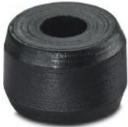
Fixing rings, for presetting the processing tools

Please be informed that the data shown in this PDF Document is generated from our Online Catalog. Please find the complete data in the user's documentation. Our General Terms of Use for Downloads are valid ( http://phoenixcontact.com/download )