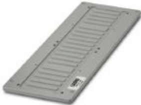
Plastic racks for CMS-P1 plotter. Accepts 2 zack marker sheets

Please be informed that the data shown in this PDF Document is generated from our Online Catalog. Please find the complete data in the user's documentation. Our General Terms of Use for Downloads are valid ( http://phoenixcontact.com/download )