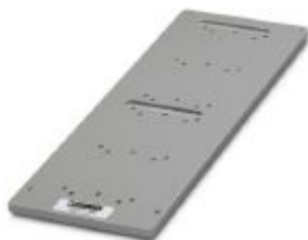
Plastic magazine for CMS-P1 plotter. Accepts 4 up to 6 PABA marker bars

Please be informed that the data shown in this PDF Document is generated from our Online Catalog. Please find the complete data in the user's documentation. Our General Terms of Use for Downloads are valid ( http://phoenixcontact.com/download )