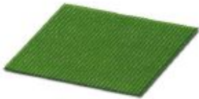
The figure shows the version CMS-P1-M/ZBFM-PAD