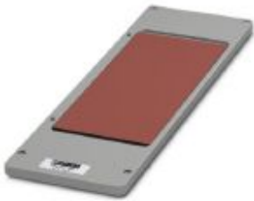
Magazine for CMS-P1-PLOTTER, to accommodate GPE materials, especially for the purpose of engraving

Please be informed that the data shown in this PDF Document is generated from our Online Catalog. Please find the complete data in the user's documentation. Our General Terms of Use for Downloads are valid ( http://phoenixcontact.com/download )