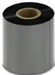
Ink ribbon, for roll printer for printing product group WMS..., width: 64 mm, color: black

Please be informed that the data shown in this PDF Document is generated from our Online Catalog. Please find the complete data in the user's documentation. Our General Terms of Use for Downloads are valid ( http://phoenixcontact.com/download )