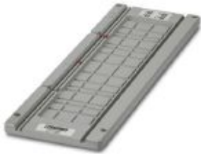
Magazine, for CMS-P1-PLOTTER, for accommodating UC-WMC 4.4...

Please be informed that the data shown in this PDF Document is generated from our Online Catalog. Please find the complete data in the user's documentation. Our General Terms of Use for Downloads are valid ( http://phoenixcontact.com/download )