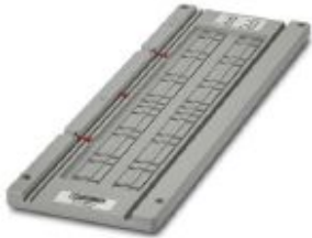
Magazine, for CMS-P1-PLOTTER, for accommodating UC-WMC 7,5...

Please be informed that the data shown in this PDF Document is generated from our Online Catalog. Please find the complete data in the user's documentation. Our General Terms of Use for Downloads are valid ( http://phoenixcontact.com/download )