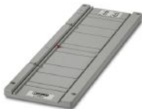
Magazine, for CMS-P1-PLOTTER, for accommodating UC1-TM..., UC1U-TM...

Please be informed that the data shown in this PDF Document is generated from our Online Catalog. Please find the complete data in the user's documentation. Our General Terms of Use for Downloads are valid ( http://phoenixcontact.com/download )