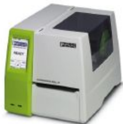
Thermal transfer printer for material off the roll up to a diameter of 200 mm

Please be informed that the data shown in this PDF Document is generated from our Online Catalog. Please find the complete data in the user's documentation. Our General Terms of Use for Downloads are valid ( http://phoenixcontact.com/download )