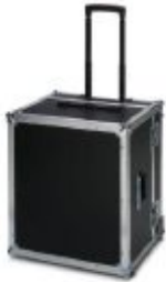
Case for the BLUEMARK CLED printer

Please be informed that the data shown in this PDF Document is generated from our Online Catalog. Please find the complete data in the user's documentation. Our General Terms of Use for Downloads are valid ( http://phoenixcontact.com/download )