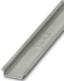
DIN rail, according to drawing, material: Steel, unperforated, height: 7.5 mm, width: 35 mm

Please be informed that the data shown in this PDF Document is generated from our Online Catalog. Please find the complete data in the user's documentation. Our General Terms of Use for Downloads are valid ( http://phoenixcontact.com/download )