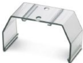
Cover profile, 36 mm long, with mounting hole

Please be informed that the data shown in this PDF Document is generated from our Online Catalog. Please find the complete data in the user's documentation. Our General Terms of Use for Downloads are valid ( http://phoenixcontact.com/download )