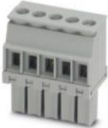
PCB connector, number of positions: 3, pitch: 3.5 mm, color: pastel green, contact surface: Tin

Please be informed that the data shown in this PDF Document is generated from our Online Catalog. Please find the complete data in the user's documentation. Our General Terms of Use for Downloads are valid ( http://phoenixcontact.com/download )