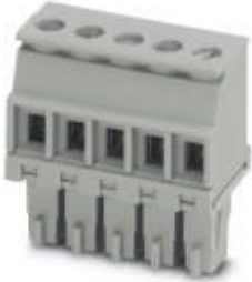
PCB connector, number of positions: 6, pitch: 3.81 mm, color: pastel green, contact surface: Tin

Please be informed that the data shown in this PDF Document is generated from our Online Catalog. Please find the complete data in the user's documentation. Our General Terms of Use for Downloads are valid ( http://phoenixcontact.com/download )