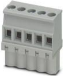
PCB connector, number of positions: 3, pitch: 5 mm, color: pastel green, contact surface: Tin

Please be informed that the data shown in this PDF Document is generated from our Online Catalog. Please find the complete data in the user's documentation. Our General Terms of Use for Downloads are valid ( http://phoenixcontact.com/download )