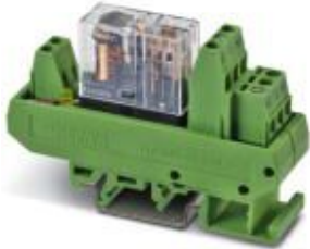
VARIOFACE relay module, pluggable, 2PDT

Please be informed that the data shown in this PDF Document is generated from our Online Catalog. Please find the complete data in the user's documentation. Our General Terms of Use for Downloads are valid ( http://phoenixcontact.com/download )